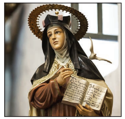
A statue of St. Teresa of Ávila stands in the sanctuary of the Serra Chapel at Mission San Juan Capistrano in San Juan Capistrano, Calif.

"But she walked," having the ability to "move forward, despite her physical defects," explained the postulator.