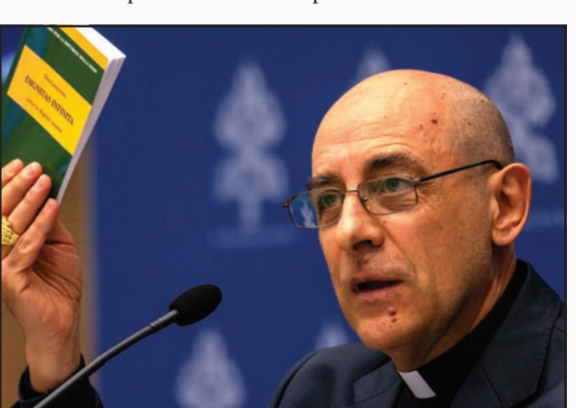
Cardinal Víctor Manuel Fernández, prefect of the Dicastery for the Doctrine of the Faith, holds up a copy of the dicastery's declaration "Dignitas Infinita" ("Infinite Dignity") on human dignity during an April 8 news conference at the Vatican press office.

Archbishop Charles C. Thompson has reflected much