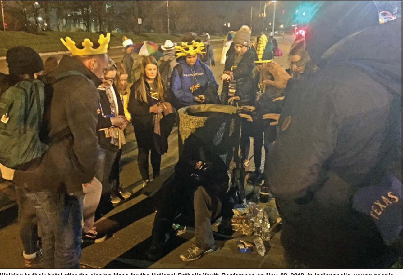
Walking to their hotel after the closing Mass for the National Catholic Youth Conference on Nov. 23, 2019, in Indianapolis, young people pray over a homeless man after stopping to offer him water and snacks.

on human dignity in leading the Church in central and southern Indiana. About six months after he began his leadership of the archdiocese, he issued "We Are One in Christ," a pastoral letter on the Christian understanding of the human person and how that is at the root of solutions to challenges facing society today.