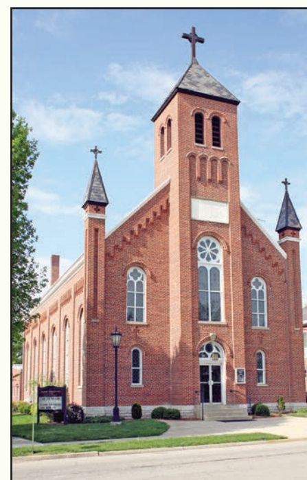
Historic St. Elizabeth of Hungary Church in Cambridge City has been the worship home of the 170-year-old parish for 142 years.

Abutting I-70 just a few miles north of Centerville is the Warm Glow Candle Company’s outlet shop. The candles are all handmade in Indiana. The outlet also features locally made arts, crafts, jewelry, oils, décor and wine. Warm Glow offers three events a year: the weekend before Mother’s Day, the last weekend in September and the first weekend in December. For more information, go to warmglow.com .