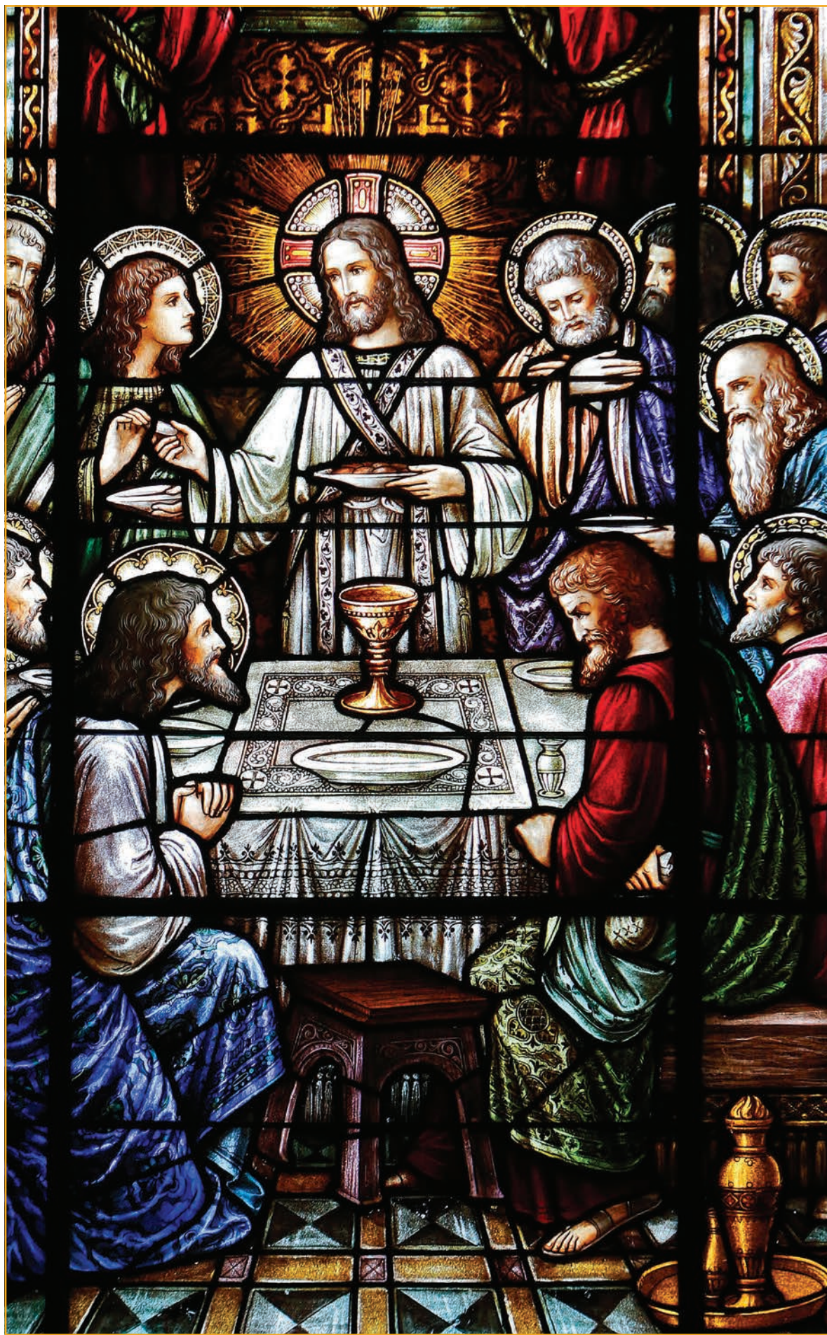
Jesus and his Apostles at the Last Supper are depicted in a stained-glass window at St. Aloysius Church in Great Neck, N.Y. At the Last Supper, St. Peter said that he would be willing to die with Jesus. The Lord replied that the Apostle would deny him three times that night before a cock crows.