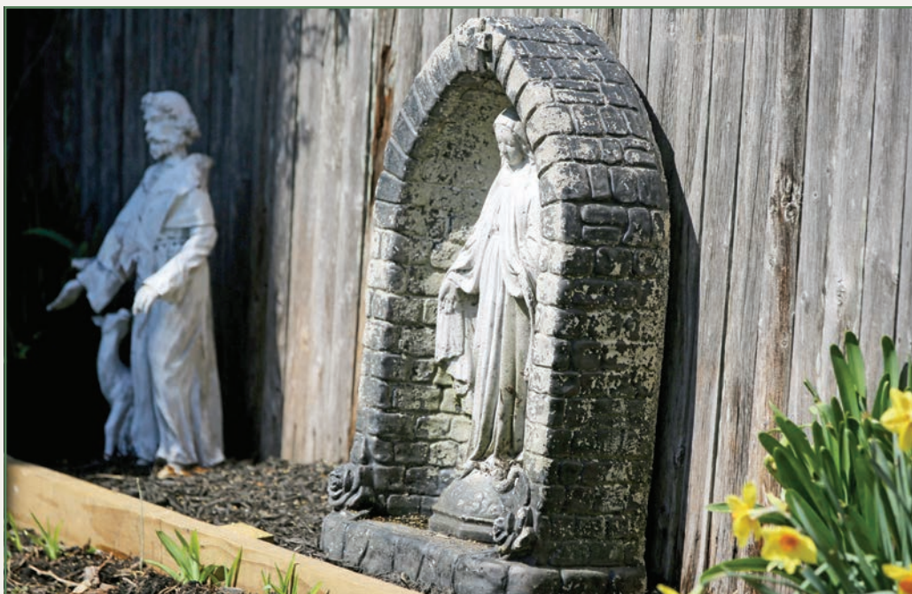
Statues of St. Francis of Assisi and Mary are pictured on March 18 outside a home in North Beach, Md.