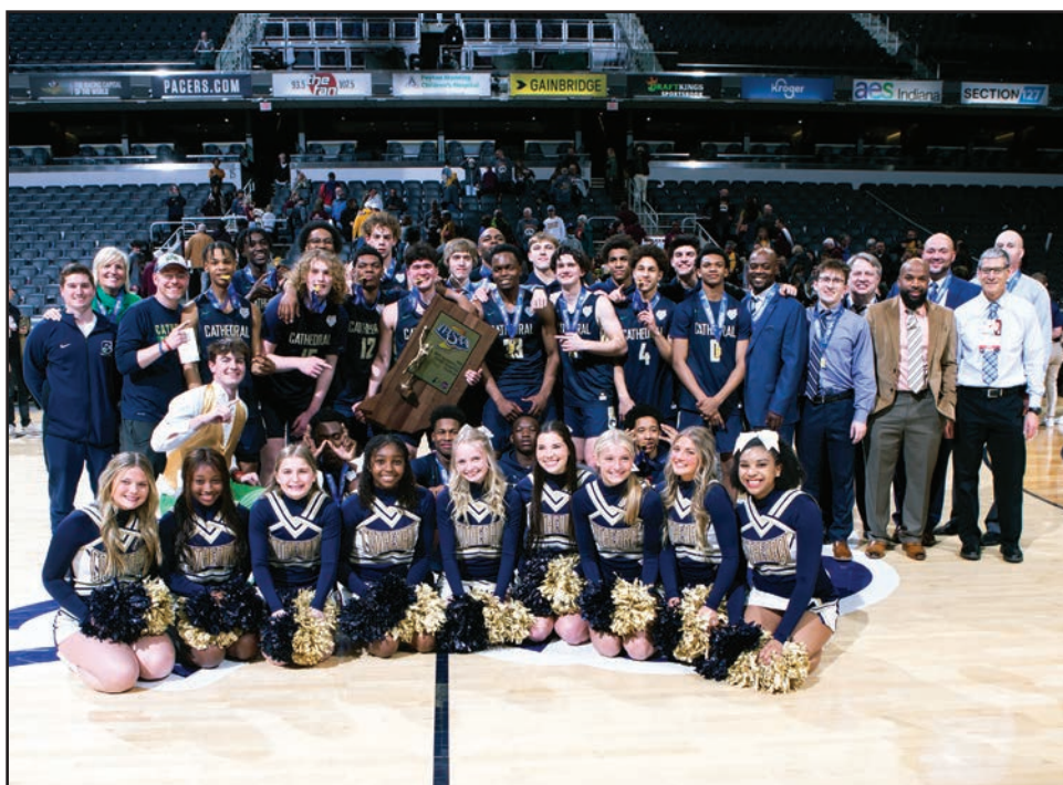
The boys' basketball team of Cathedral High School in Indianapolis celebrates its state championship on March 26 at Gainbridge Fieldhouse in Indianapolis.