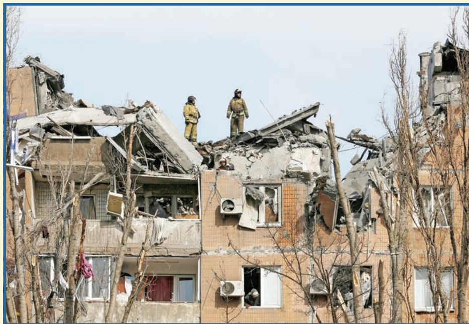
Firefighters work at a residential building destroyed during the Russian war in the self-proclaimed People's Republic of Donetsk on March 30. Nearly 3,000 civilians have been killed or injured in Ukraine and more than 10 million displaced since Russia launched its invasion more than a month ago, the United Nations said on March 28.