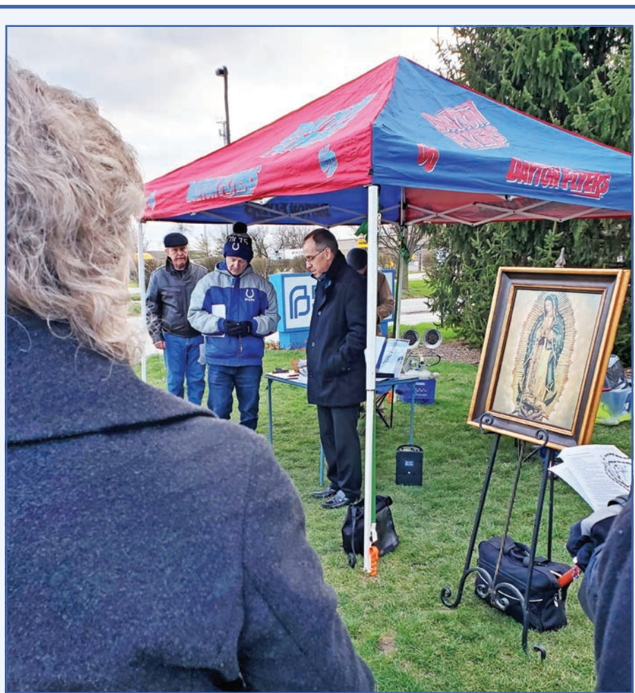
Archbishop Charles C. Thompson leads members of the Knights of Columbus in prayer on April 1 in front of the Planned Parenthood abortion center in Indianapolis.