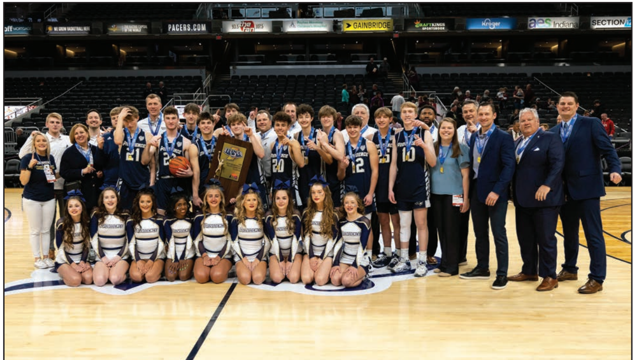
The boys' basketball team of Our Lady of Providence High School in Clarksville celebrates its first state championship on March 26 at Gainbridge Fieldhouse in Indianapolis.