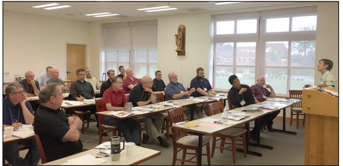
Priests listen to a presenter at the Toolbox for Pastoral Leaders workshop at Saint Meinrad Seminary and School of Theology in Saint Meinrad on Sept. 29. The workshop was made possible through the archdiocesan Empowering Pastoral Leaders for Excellence in Parish Leadership and Management project, which is funded through a Lilly Endowment grant.

"One of the things a number of them said in both groups was it was like