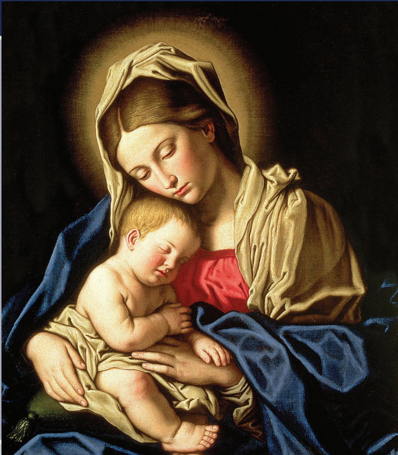
Mary and the Christ Child are depicted in this 17th-century painting by Giovanni Battista Salvi. The feast of the Nativity of Christ, a holy day of obligation, is celebrated on Dec. 25.