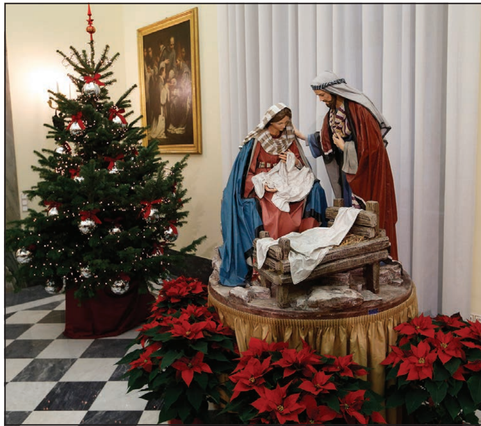
A Nativity scene and Christmas tree decorate the Apostolic Palace at the Vatican on Dec. 15, 2014. The familiar scene points beyond itself to remind believers that Christ is the Word of God, who "became flesh and made his dwelling among us" (Jn 1:14).

For Christianity's early centuries witnessed many who, viewing our physical, earthly world as a place deserving to be fled, did not believe that