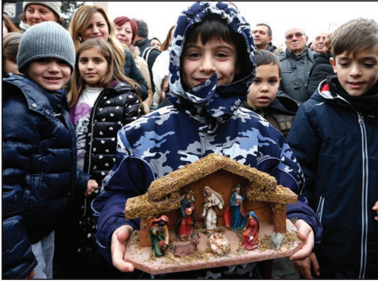
A boy holds his Nativity scene as Pope Francis leads the Angelus from the window of his apartment overlooking St. Peter's Square at the Vatican on Dec. 11. In an annual tradition, Roman children brought their figurines of the baby Jesus to the Angelus.