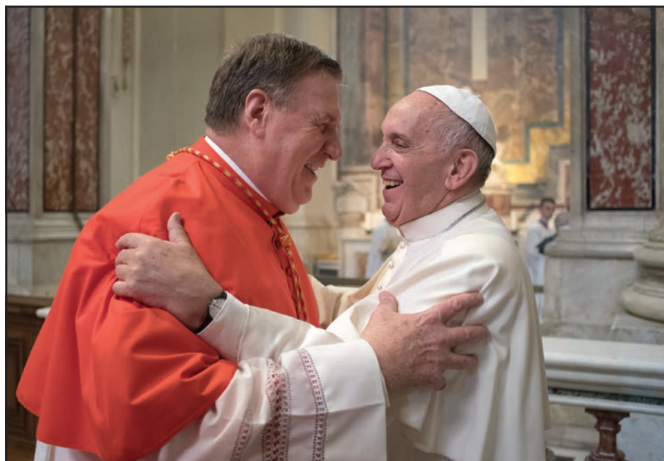
Cardinal Joseph W. Tobin embraces Pope Francis after the consistory that made him a cardinal on Nov. 19 in St. Peter's Basilica at the Vatican.

In October of 1966, a small group of dedicated Catholics met in Indianapolis to do what their counterparts in only a handful of states had accomplished—to formalize a way for the Catholic Church to speak on both state and national issues. That was the genesis of the Indiana Catholic Conference [ICC], which this fall marked the 50th anniversary of its establishment as the public policy voice of the Catholic Church in Indiana.