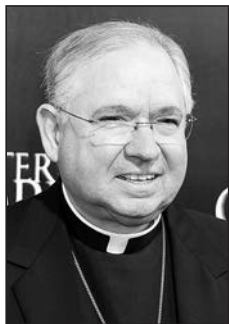
Archbishop Jose H. Gomez