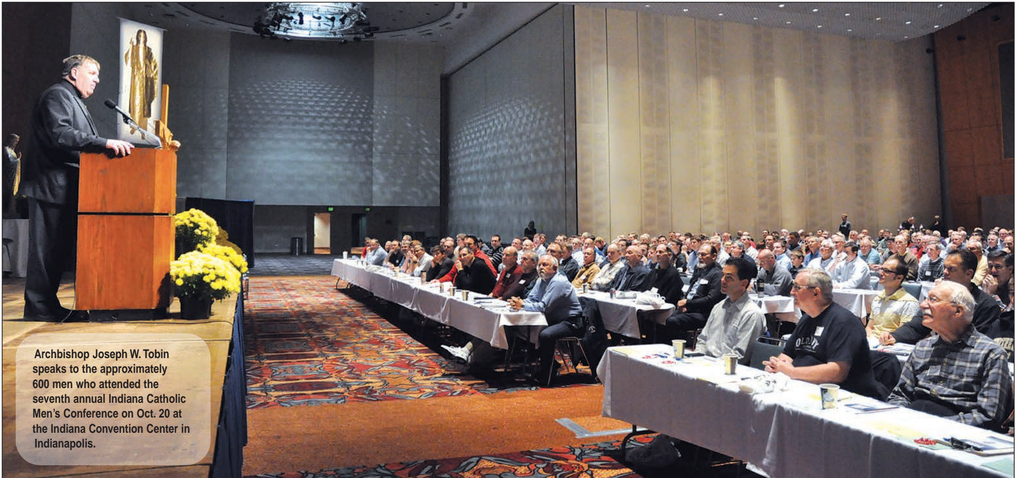
Archbishop Joseph W. Tobin speaks to the approximately 600 men who attended the seventh annual Indiana Catholic Men's Conference on Oct. 20 at the Indiana Convention Center in Indianapolis.