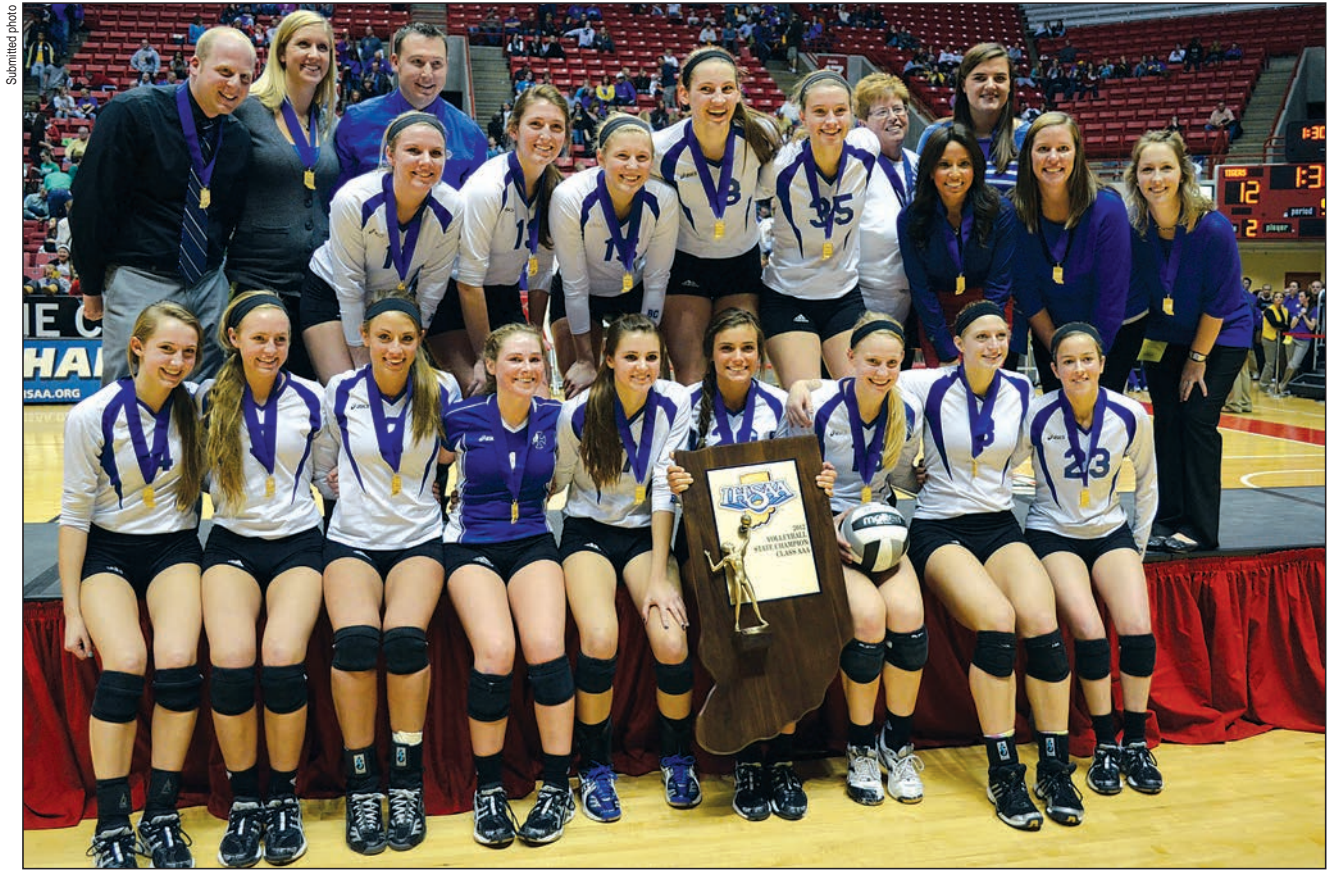
Members of the Bishop Chatard High School Class 3A state championship girls' volleyball team pose with their trophy on Nov. 3.