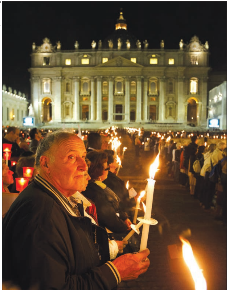
Pilgrims attend a candlelight vigil in St. Peter's Square at the Vatican on Oct. 11 to mark the 50th anniversary of the opening of the Second Vatican Council. The council's "Dogmatic Constitution on the Church" reached back to scriptural and patristic sources to emphasize that the Church is a mystery.

Vatican II's willingness to embrace the notion of the Church as mystery reflects a dynamic sense of God's presence throughout creation and a confidence that the Church is not isolated. Rather, the Church's mission calls it to engage the world in order to transform it.