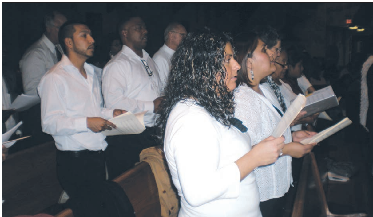
Left, members of the choir sing during the annual St. Martin de Porres feast day Mass on Nov. 3.