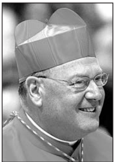
Cardinal Timothy M. Dolan