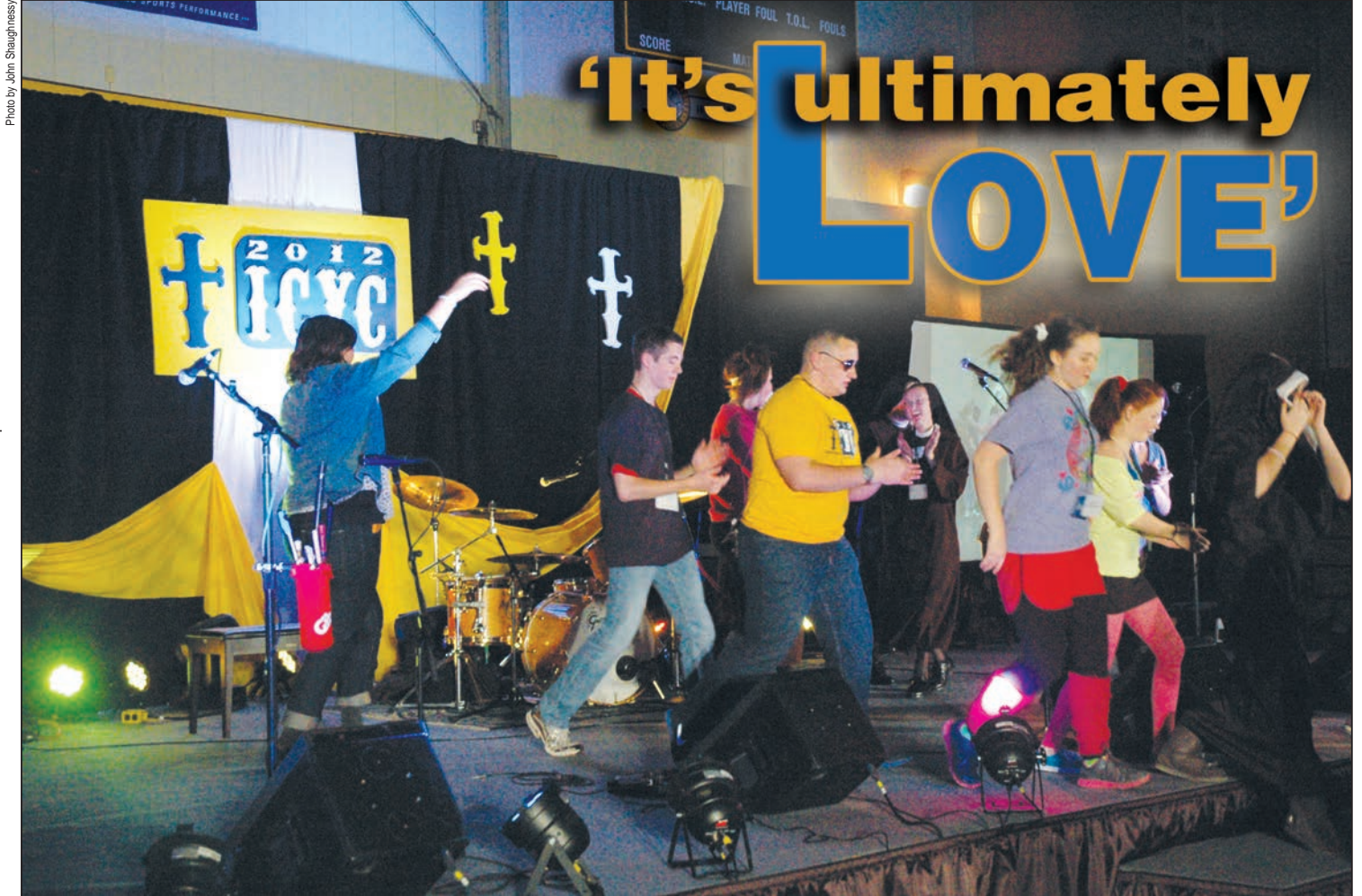
The 2012 Indianapolis Catholic Youth Conference begins with singing, dancing and cheering on Nov. 3 at Marian University in Indianapolis. Nearly 700 youths from the Archdiocese of Indianapolis and the Diocese of Lafayette, Ind., attended the event.