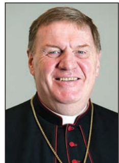
Archbishop Joseph W. Tobin

Seating for this Mass will be by invitation only, and attendees will need a ticket to enter the cathedral.