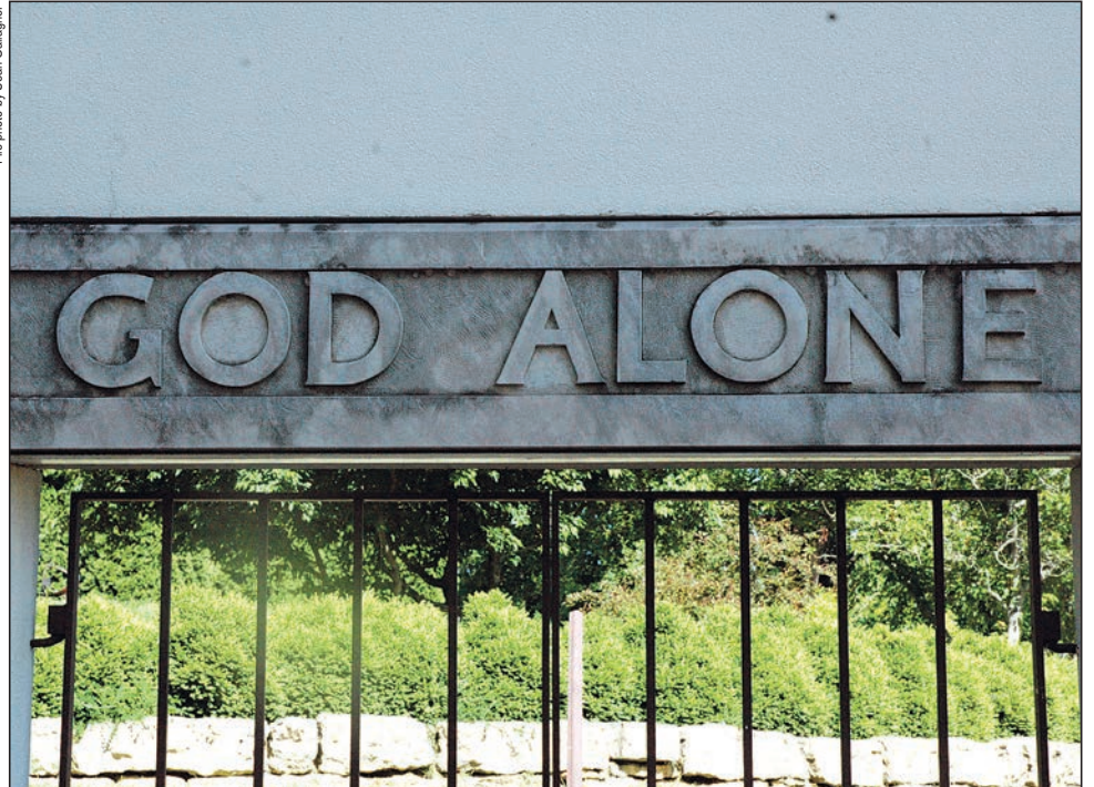
The message "God Alone" is carved in stone above the entrance to a monastic courtyard and adjacent to the entrance of the guest house at Gethsemani Abbey, a Trappist monastery near Bardstown, Ky. Monasteries are places where people can get away from the busyness of their secular lives to spend time alone with God in prayer.

Scripture, especially the psalms. And, of course, the very center of monastic life is the Eucharist.