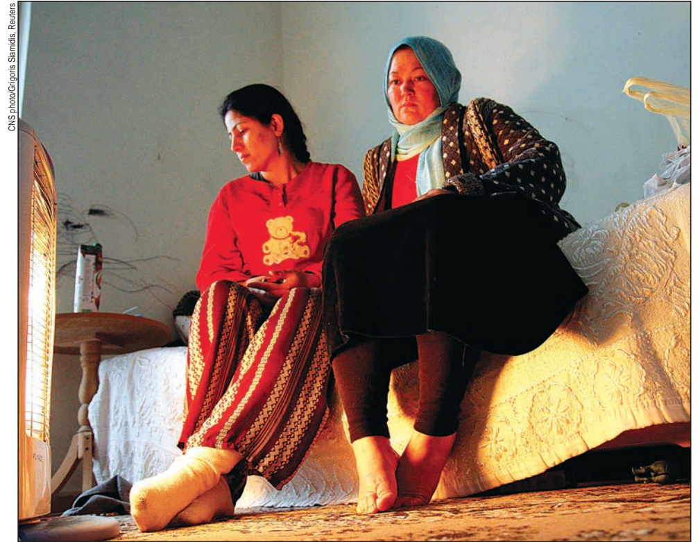
Women warm themselves inside a room of a refugee guest house in Thessaloniki, Greece, on Jan. 14, 2011. A recent conference in Rome sponsored by the U.S. embassy to the Holy See discussed the dangers faced by women migrants.

In particular, the fact that so many women migrants end up doing domestic work means they are employed in the least regulated sector of most countries’