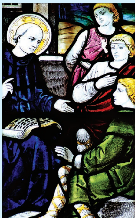
An artist's depiction of St. Aidan and the Lindisfarne Gospels is seen in a stained-glass window at Lichfield Cathedral in Lichfield, England.