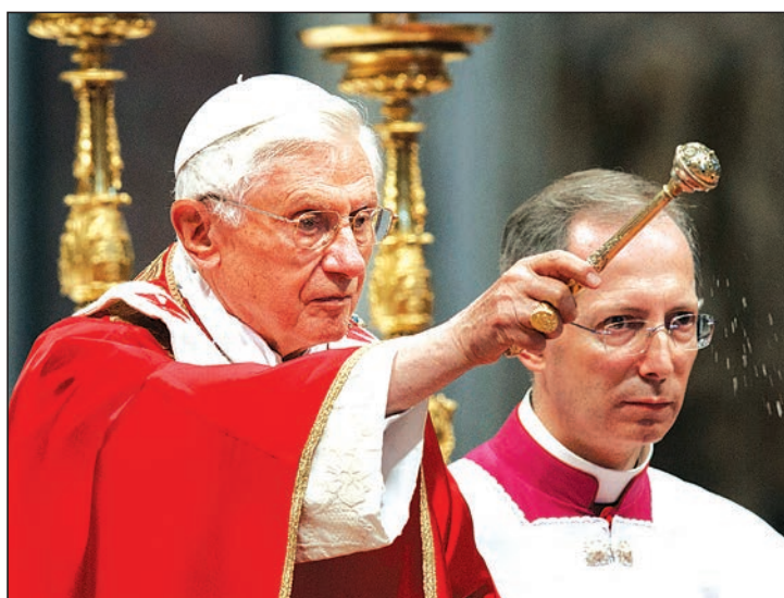
Pope Benedict XVI sprinkles holy water during Mass on the feast of Pentecost at St. Peter's Basilica at the Vatican on May 27.

VATICAN CITY (CNS)—The modern world is a latter-day Babel, where arrogance inspired by technological progress leads people to play God and sets them against each other, a predicament from which people can escape only through divinely inspired humility and love, said Pope Benedict XVI.