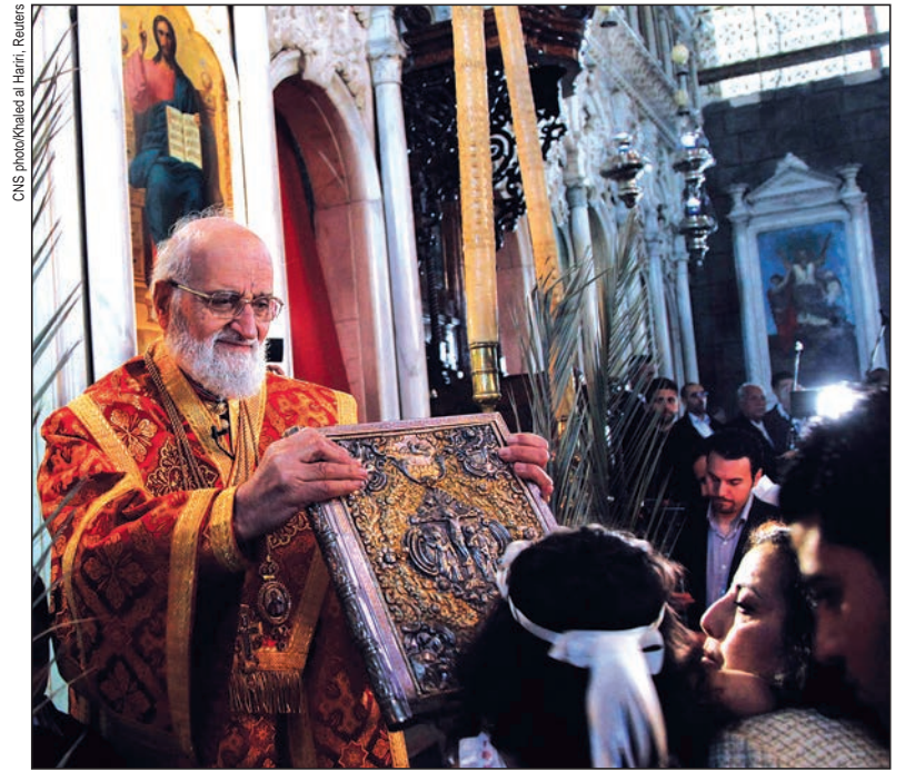
Melkite Patriarch Gregoire III Laham of Damascus holds up a Book of the Gospels for veneration during a Palm Sunday liturgy at the Melkite Catholic cathedral in Damascus, Syria, on April 1. In a report from the Melkite Archdiocese of Homs, Syria, Patriarch Laham urged the international community to "save Syria."

The patriarch called the attack "an act of cruelty without precedent in Syria, which has shown the true face of the forces at work behind this absurd propaganda war," and said the world "is not listening to the Syrian people's cries of distress." †