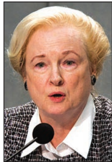
Mary Ann Glendon